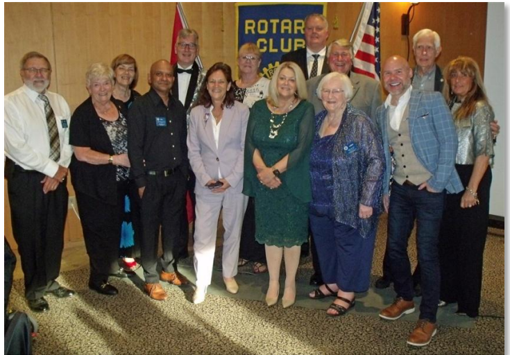
(Where is the photographer?)

And then of course there were the current members: