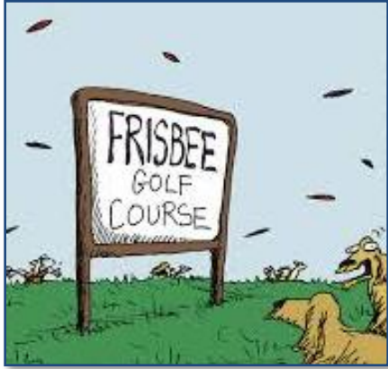
"It's the Promised Land!"