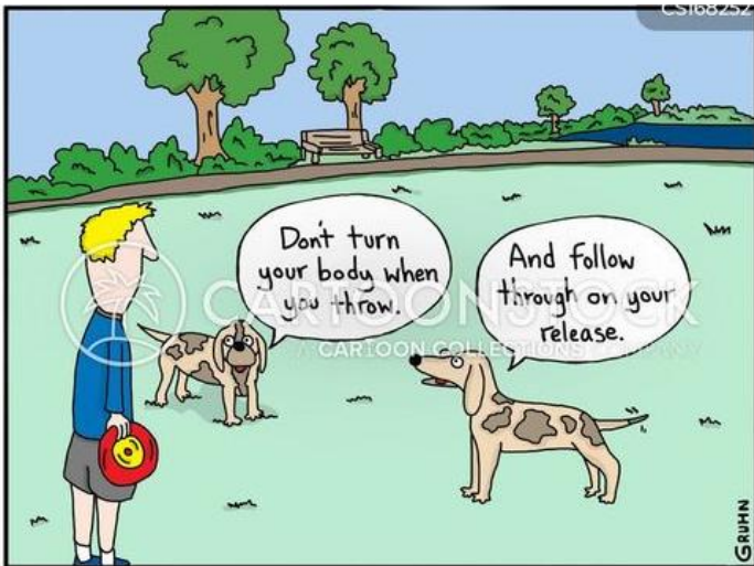
English Pointers giving pointers