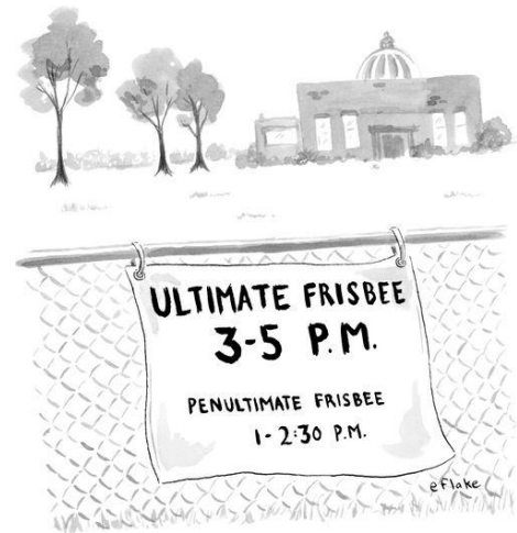
(Note Dave's bird sanctuary in the background)

[You will note that "Ultimate" is one of the many sporting events that will be included in the Maple Ridge 2024 BC Summer Games. According to Google, "Ultimate is a non-contact, self-refereed team sport played with a flying disc frisbee." Keesha now qualifies to compete in "Penultimate Frisbee" in 2024!]