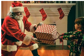
SANTA’S STEALING GAME

OUR GIFT EXCHANGE could also be variously known as: