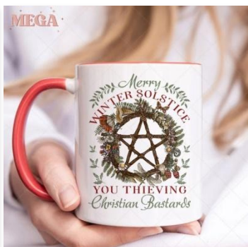
A JOLLY THIEVING CHRISTMAS