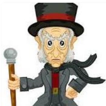
SCROOGE’S CHRISTMAS PRESENT