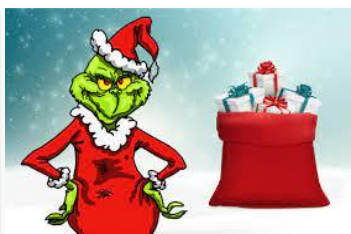
THE GRINCH GIFT SNITCH