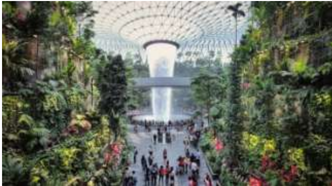
Gardens by the Bay

She visited the famous “Gardens by the Bay” and saw the laser show at night.