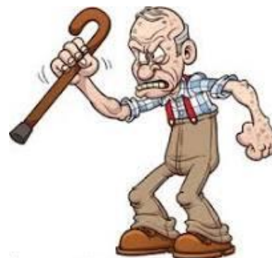
Matt raising Cain

[No other introduction of Matt was available (or is needed)]