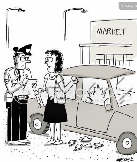
"ACTUALLY, ALL THEY STOLE WAS THE CAR ALARM!"