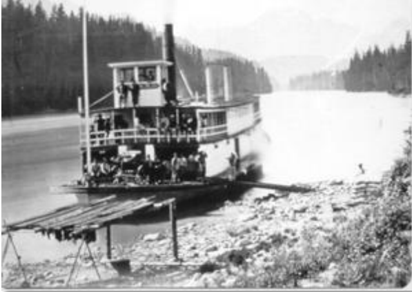
Sternwheeler – the workhorse of the river

Maple Ridge was incorporated as a district municipality on September 12, 1874. This was 12 years before the City of Vancouver, making it British Columbia's fifth-oldest municipality (after New Westminster, Victoria, Langley, and Chilliwack). Up to incorporation, early settlers lived along the Fraser River, and used mainly paddle wheelers for their transportation to get up and down the river.