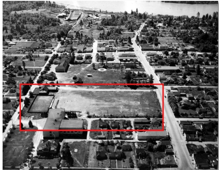
Aerial view looking down between 224th and 225th Streets toward the Fraser River. The Aggie grounds/future spot of Memorial Peace Park highlighted, 1948.

In 1931, the Lougheed Highway was constructed, and the impetus to consolidate the various communities under one postal address was started. Pitt Meadows ceded from Maple Ridge in 1896, later becoming a district municipality itself in 1914.