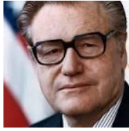
and Nelson Rockefeller ),

The Fine Master also levied a fine of $1.00 on anyone who had the audacity to be under the age of 70