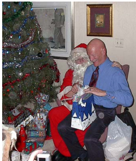
One little naughty Santa