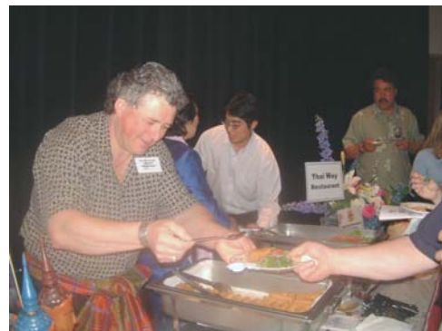
Thai Way Restaurant