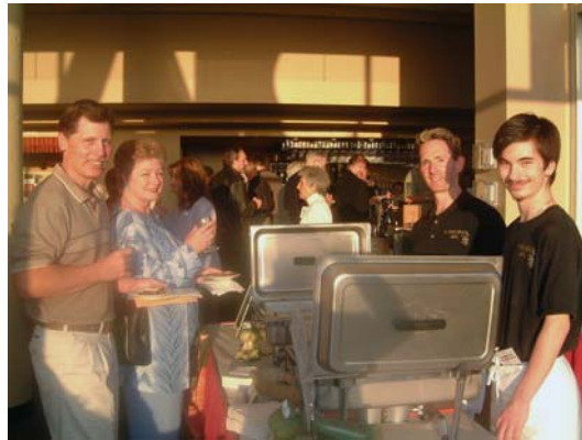
The Frogstone Grill