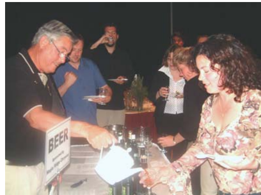
T is for Terrible!