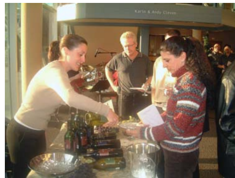
EJ Gallo Winery