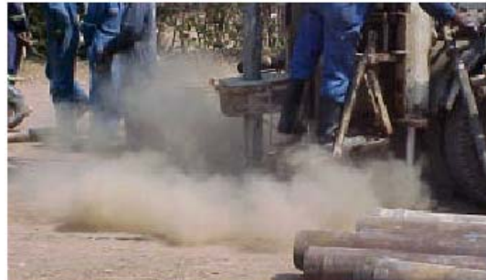
Kicking up the first dust at 11:15 am on 11th August 2003.