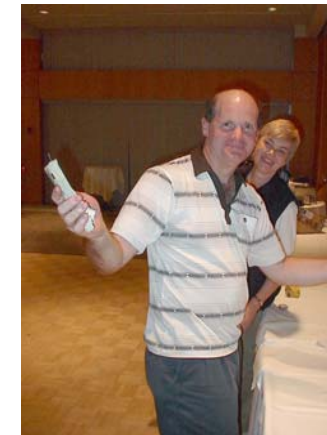
The most lucky player