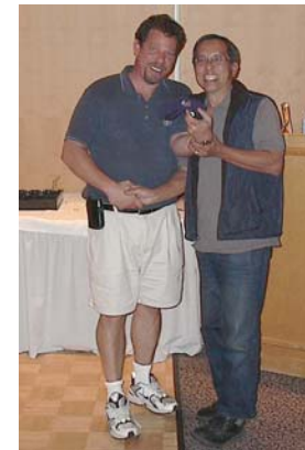
The most honest player