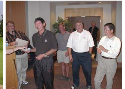
followed by the Putters.