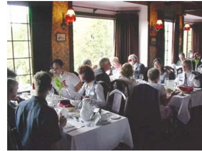
New Member Drive