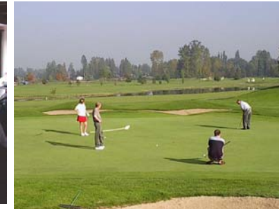
A long Drive,