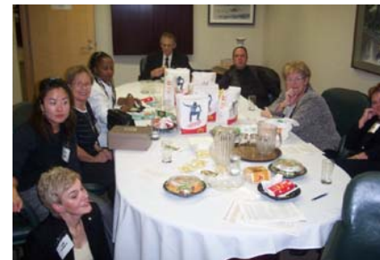
Sports Banquet 2004 The Volunteer Table