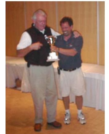
Simply the Best!