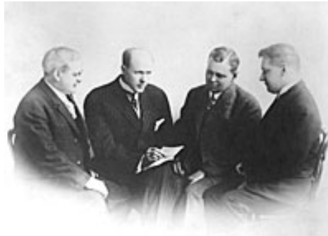
Rotary was founded on 23 February 1905 by Paul Harris (second from left) and three businessmen.