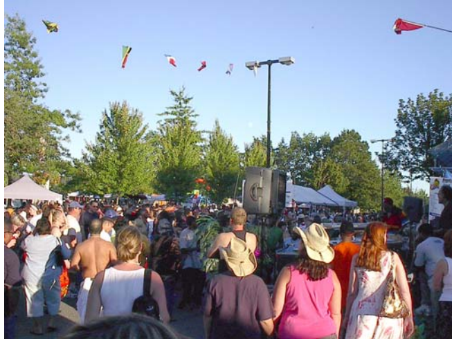
Last Sunday's Caribbean Street Festival

The Caribbean Festival was original set up by the merchants of 224 th Street, but now has grown out to a real community event; this year will be the fifth annual Festival. It attracts hundreds of people all around from the lower mainland.