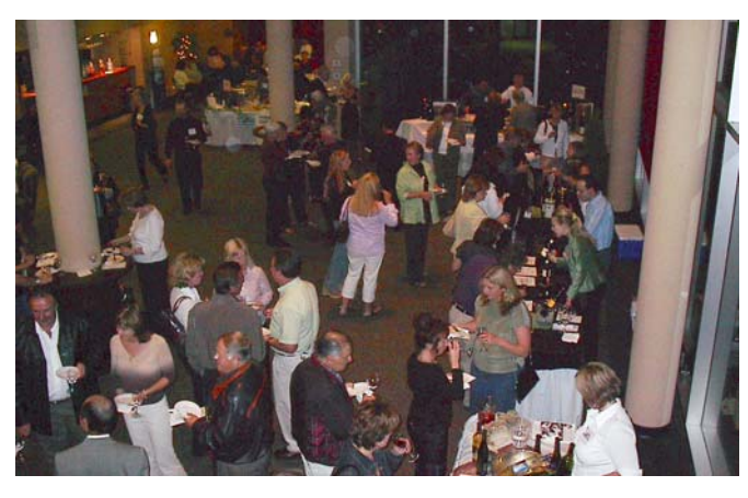
A big, but pleasant crowd

How much money did we make? Well, we need to pay all the bills first, but if I make a wild guess, I would think the clear proceeds will be somewhere around the $10,000.= mark, and that's a pretty good result!!