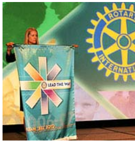
The Lead the Way banner was unfurled for the first time at the International Assembly.

As we embark on a new Rotary year, we look ahead to new responsibilities, new challenges, and new opportunities.