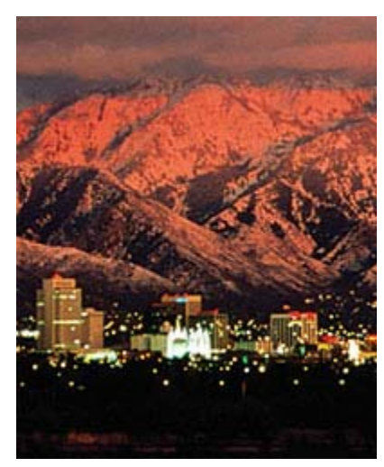
Salt Lake City's Rocky Mountain skyline.

31 May at on-site prices. Learn more at the "How to Register" page.