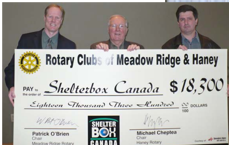
The three major players exposed.