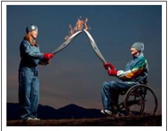
Para-Alpine Skier, Lauren Woolstencroft and retired Para-Alpine Skier, Brad Lennea lighting their torches

The 10-day relay, supported by the Government of Canada, will illuminate the extraordinary achievements of Paralympians and celebrate the endless possibilities of the human spirit. The 2010 Paralympic Torch Relay will start with a uniquely Canadian lighting ceremony in Ottawa and will involve approximately 600 torchbearers. The relay will visit several celebration sites before arriving at BC Place in Vancouver for the opening of the 2010 Paralympic Winter Games on March 12.