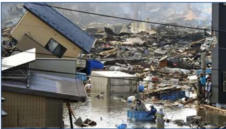
Rotary International News -- 14 March 2011

In response to the massive earthquake and tsunami that struck Japan on 11 March, The Rotary Foundation has established the Rotary Japan 2011 Disaster Recovery Fund,