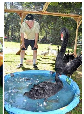
Lots of stuff to do for kids too.