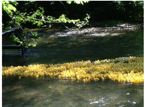
Trying to set a new Olympic Record.