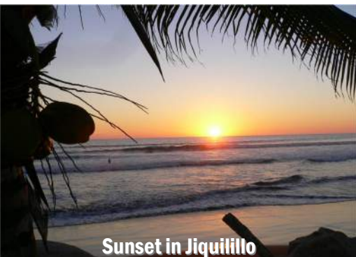
Sunset in Jiquilillo