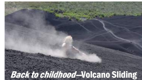
Back to childhood—Volcano Sliding