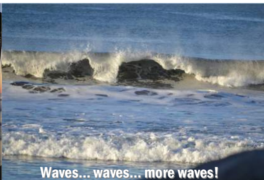
Waves... waves... more waves!