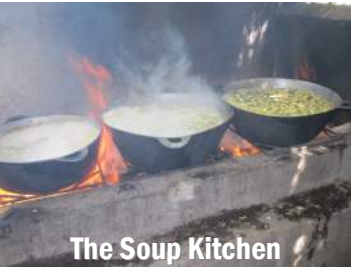
The Soup Kitchen

In addition we assisted with the preparation of one school for painting, and replaced the roofs on three of four buildings at two of the three schools. We repaired/replaced shelving for the classrooms and worked in the local soup kitchen.