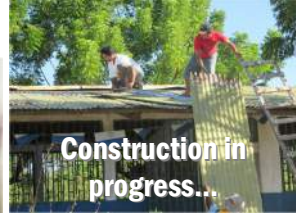
Construction in progress...