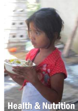
Health & Nutrition