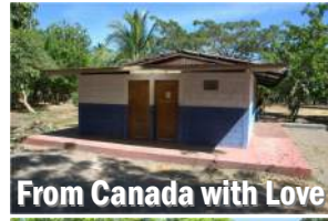
From Canada with Love