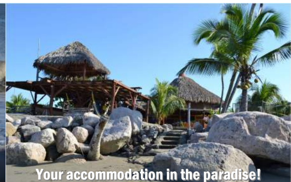
Your accommodation in the paradise!