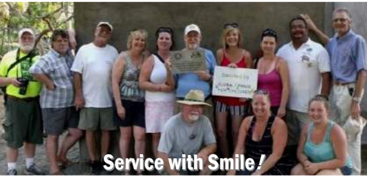
Service with Smile!

In October 2012 the Rotary Clubs of Coquitlam Sunrise and Kamloops West replaced pit toilets at 3 schools in the Jiquilillo area of Nicaragua. The objective of the project was to build modern latrines complete with flush toilets, septic systems and hand washing facilities at each school. The goal was to improve sanitation and health for 450 students and the 16 staff members, plus prepare lunch for 250 children at a local soup kitchen. With the assistance of a District 5050 Grant we were able to successfully complete the project.