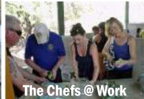
The Chefs @ Work