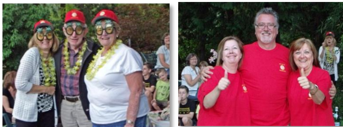
Highest score .....Lowest score