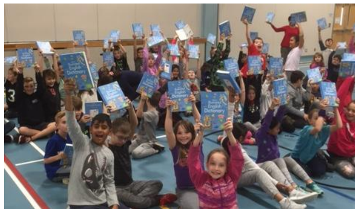
Program: Mini Projects