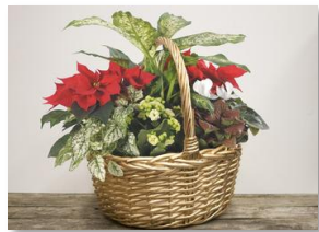
Wicker Christmas Basket (Not exactly as shown)

Only $25. 00 each, or $20. 00 ea when buying 3 or more.