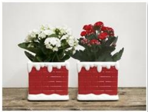
4" Ceramic Chimney pot / with Kalanchoe

$25. 00 ea. - includes taxes & card $23. 00 ea - when buying 3 or more.