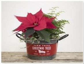
7" Farm Fresh Tin w. handles

Plants are provided at cost by Maple Ridge Florist and include a handmade Christmas card for easy gift giving! Delivery: Tuesday Dec. 3 - Dec. 10, 2019