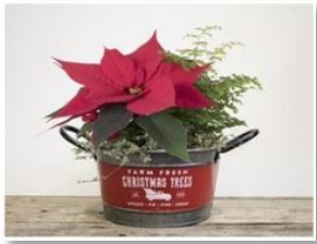
7" Farm Fresh Tin w. handles

Plants are provided at cost by Maple Ridge Florist and include a handmade Christmas card for easy gift giving! Delivery: Tuesday Dec. 3 - Dec. 10, 2019