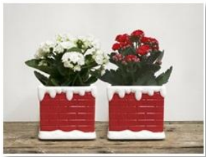
4" Ceramic Chimney pot / with Kalanchoe

$25. 00 ea. - includes taxes & card $23. 00 ea - when buying 3 or more.