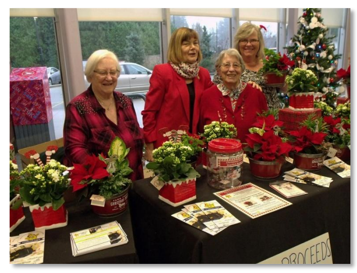
December 4 – Ridge Meadows Hospital - Christmas Plant Sale