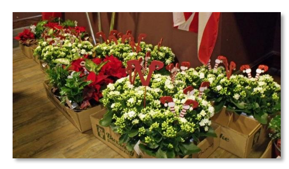
And now the plants can go to the RM Hospital plant sale, with the proceeds going to the Starfish Pack Program.