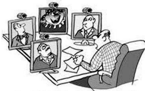
"Okay, who invited that clown to this meeting?"

April 7, 2020 was our second virtual meeting and it followed our usual club format.