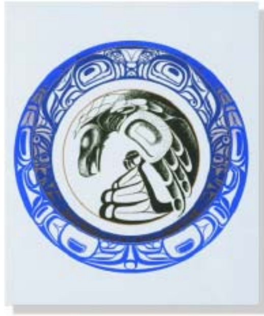
Native Art: 'Spirit of the Rotary'

Each district governor performs a very important role in the world-wide operations of Rotary. The district governor is truly a prime example of Service Above Self performing a labour of love.