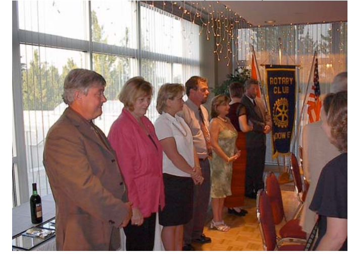
The new Executive (from l to r)