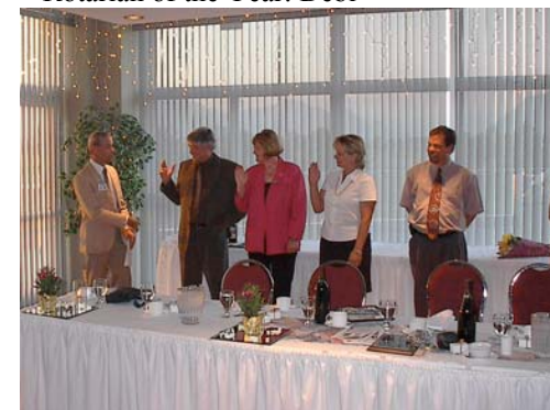
Swearing in of the Directors