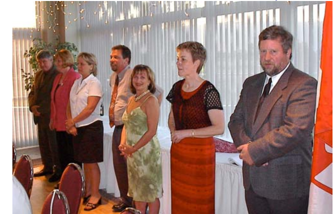
The new Executive (from r to l)