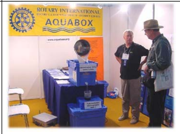
Rotarians demonstrate the use of "aquaboxes" to provide clean drinking water in developing countries.