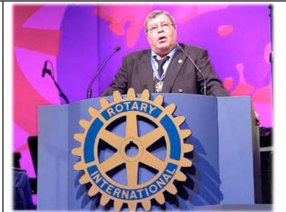
American entertainer Jerry Lewis received the Rotary Award of Honor in appreciation of his work on behalf of children with disabilities. Lewis is one of the first nonpolitical leaders to receive this award, which is usually presented to heads of state.