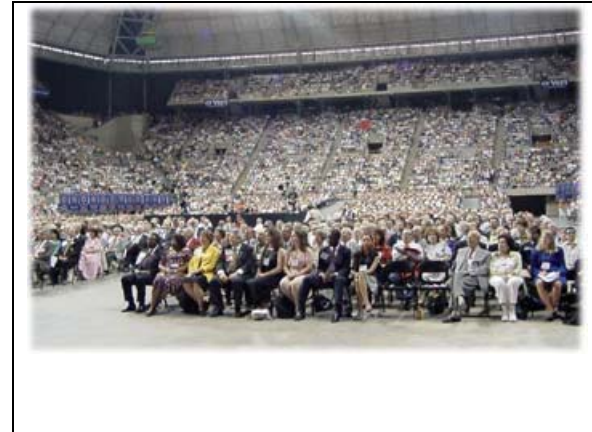
Convention participants gather Sunday afternoon for the spectacular opening plenary session, held at the Palau Sant Jordi.