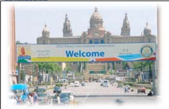
A huge welcome banner greets Rotarians at the entrance of the Placa de Espanya in Barcelona.