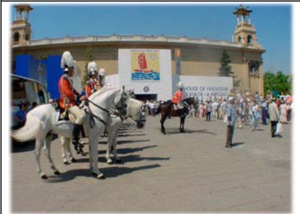
A team of elegant equestrians herald the grand opening of the House of Friendship.