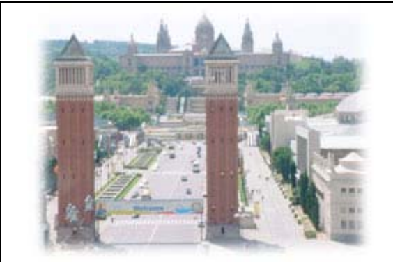
A birds-eye view of the Fira de Barcelona (fairgrounds), main site of the convention. Here Rotarians can register, visit booths and exhibits, and enjoy fellowship and entertainment at the House of Friendship.