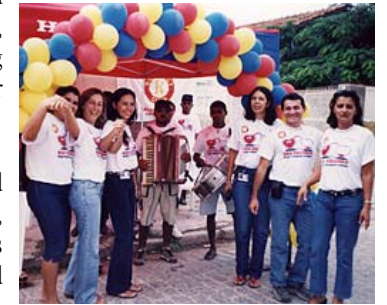
During World Rotaract Week 2002, members of the Rotaract Club of Salgueiro, Pernambuco, Brazil, promoted blood donations.

For information on Rotaract club sponsorship, contact RI Rotaract staff at (847) 866-3315 or rotaract@rotaryintl.org .