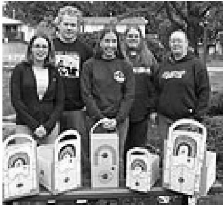
Youth in Rotary Pictures – Left to Right