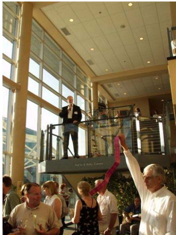
“Looking good in that TUX”