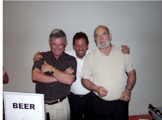
“The Three Amigos”