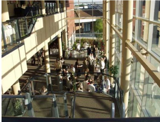
“A great venue”