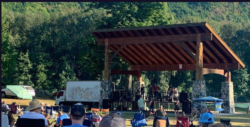
The Amphitheatre Project allows the Club to host a summer concert series free to Sedro-Woolley residents.