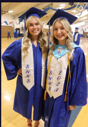
Money generated through our auction and the Great Sedro-Woolley Footrace allowed SW Rotary to contribute over $40,000 towards scholarships for area graduates in 2023.