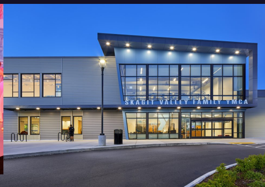
Along with other area service organizations, the SW Rotary agreed to become a major donor towards construction of the new YMCA.