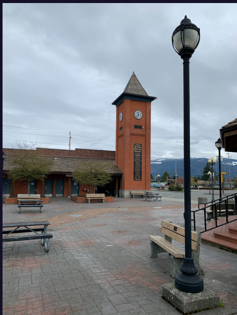
The club's Hammer Heritage Square Project provided much needed bathrooms to the downtown area for events enjoyed by the entire community.