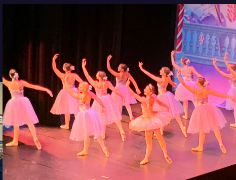
Partnering with McIntyre Hall allowed the SW Rotary to make a significant financial contribution to our community.