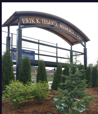
Moving Tesarik Ball Fields from its original site, along with the construction of new bleachers, dugouts, fencing and play field refurbishing, has made it the premier field for Little League.