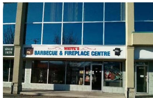
White's Barbecue and Fireplace Centre 160-2000 Spall Road, Kelowna, B.C. V1Y 9P6 250-862-3240 www.barbecueandfireplacecentre.com/