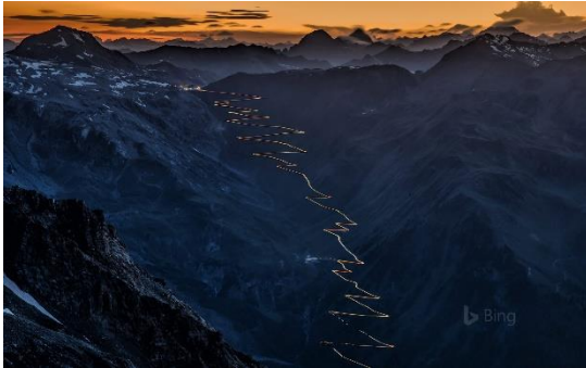
Stelvio Pass in the Italian Alps