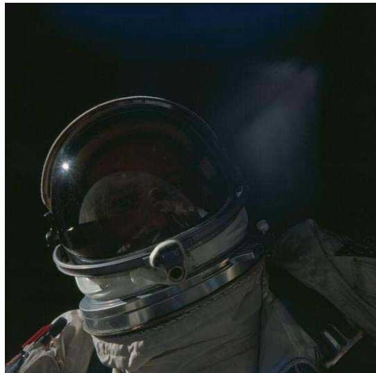
Buzz Aldrin taking a selfie in space (1966)