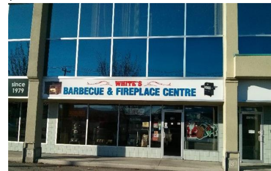
White's Barbecue and Fireplace Centre 160-2000 Spall Road, Kelowna, B.C. V1Y 9P6 250-862-3240 www.barbecueandfireplacecentre.com/