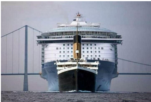
Titanic in a comparison with a modern cruise liner