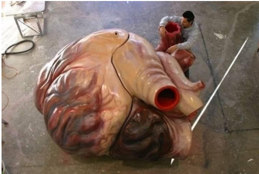
Average Blue whale heart. Note man standing to the upper right