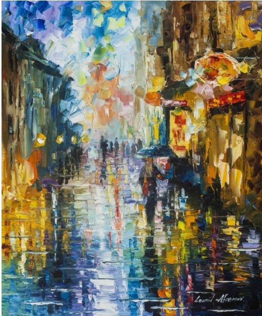
Morning Full of Rain by Leonid Afremov (Mexico)