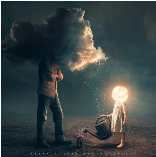
The Battle by Kevin Carden (USA)