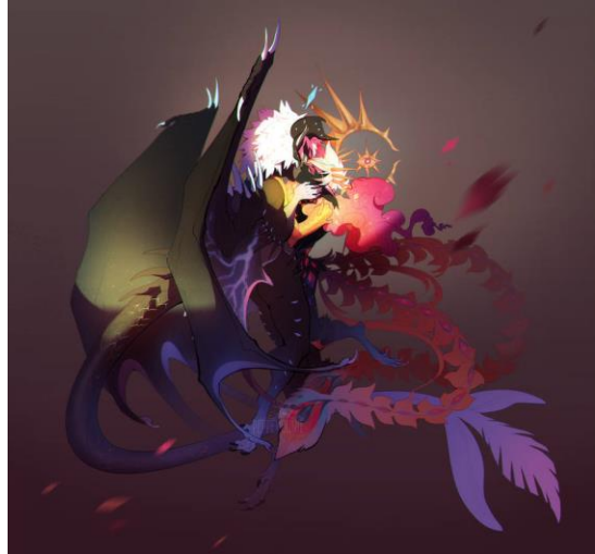
Silver and Gold by Pepper (Lebanon)