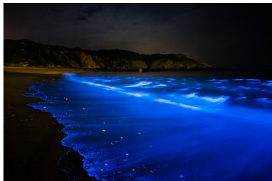
If you see a bright blue glow in coastal ocean waters at night, it could be Noctiluca scintillans . Also known as sea sparkle, these bioluminescent plankton float under the surface and flash brightly when disturbed, possibly to scare off or distract predators.