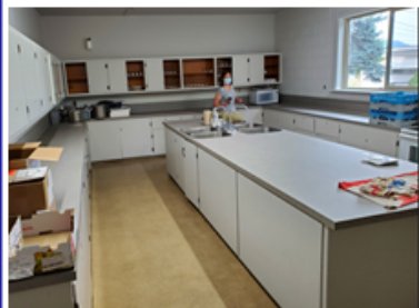
Support renovation East Kelowna Hall