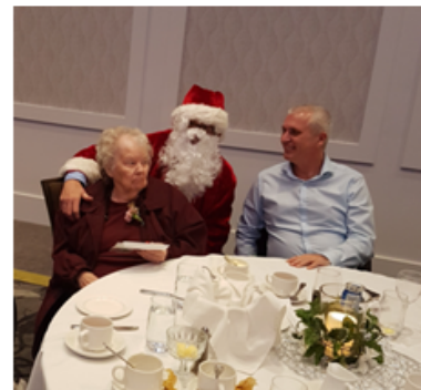
Christmas party for residents Cottonwoods