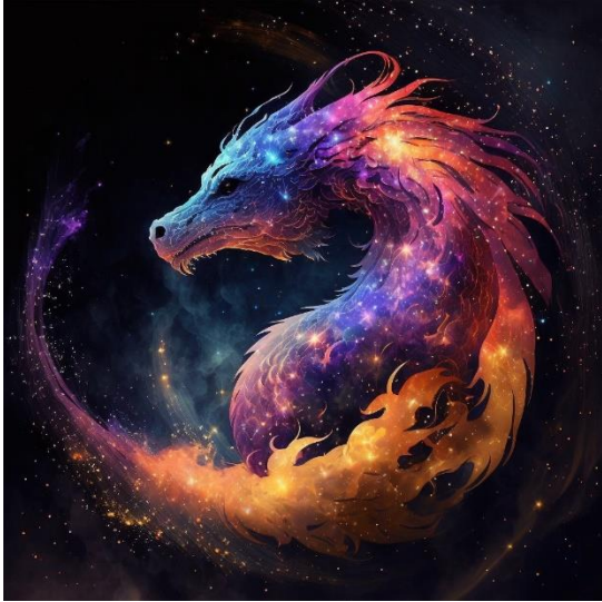
Geommayn by Sint3tico (USA)