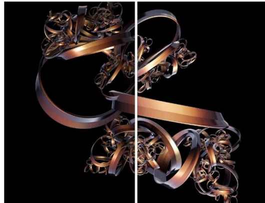
Incendia Abstraction by Bukoslav (Slovakia)