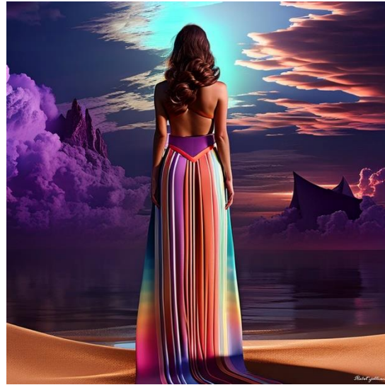
Girl at the Beach in Towel by RebelTell (Netherlands)