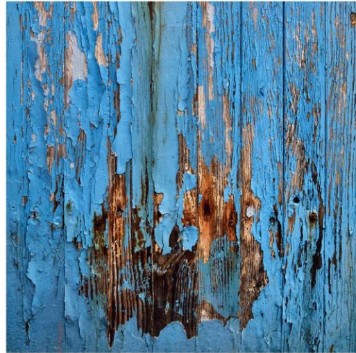
Preserving the Blues by Eintoern (Germany)