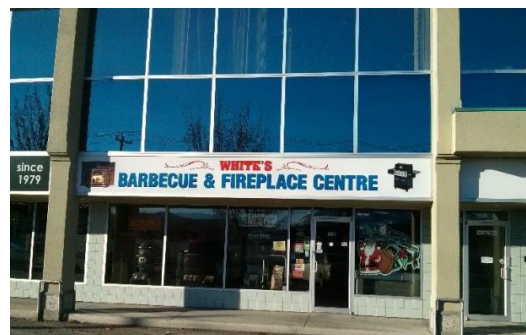
White's Barbecue and Fireplace Centre 160-2000 Spall Road, Kelowna, B.C. V1Y 9P6 250-862-3240 www.barbecueandfireplacecentre.com/