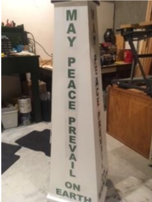
The 4-sided Pole made by Lockie for display purposes as we try to convince the City to establish a Peace Park.

DISTRICT VIDEO SITE - The District has a Vimeo Pro subscription with many videos for training and inspiration.