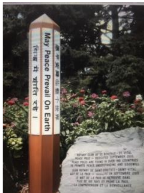
This 8-sided pole is in St. Vital Park in Winnipeg