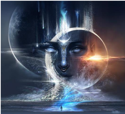
Shores of Consciousness by Alex Ruiz Art (USA)