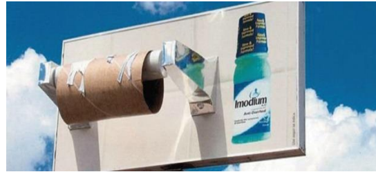
The bottle says Imodium