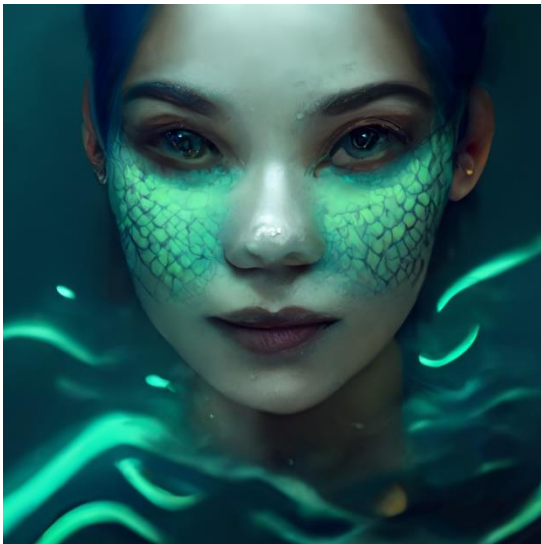
From the Deep by Liat Karpel Gurwicz (Israel)