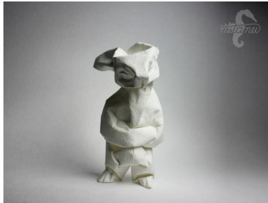
Mischief by Mitanei (USA)