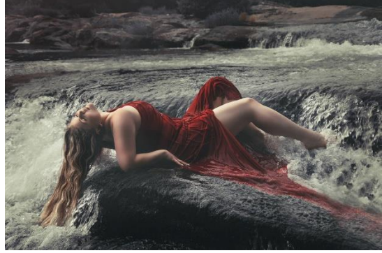
It Runs Red by Lilith Jenovax (USA)