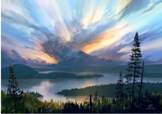
Skies of the Wild by Alexander Rommel (Germany)