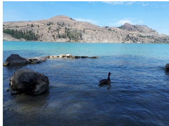
Kalamalka Lake Park