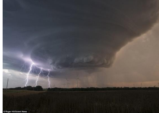
Supercell_thunderstorm by Nicholas Barretto (USA)