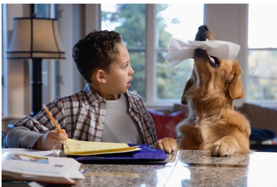
The dog ate my homework!