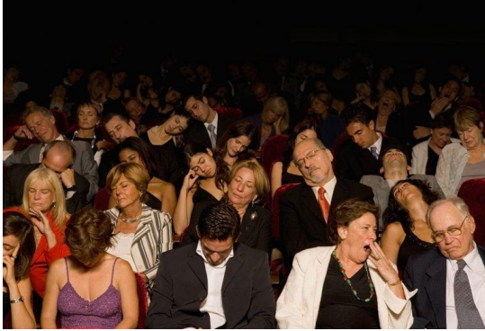
Not the most interesting film!