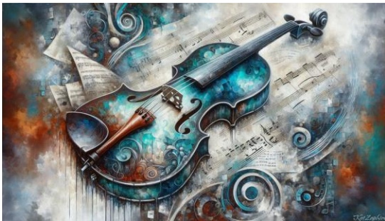
Something Old Something Blue by Kat Zaphire (Sweden)