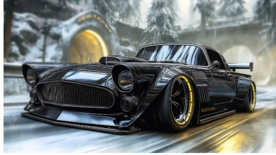
Thunderbird Nighthawk II by Shamanx (Ukn)