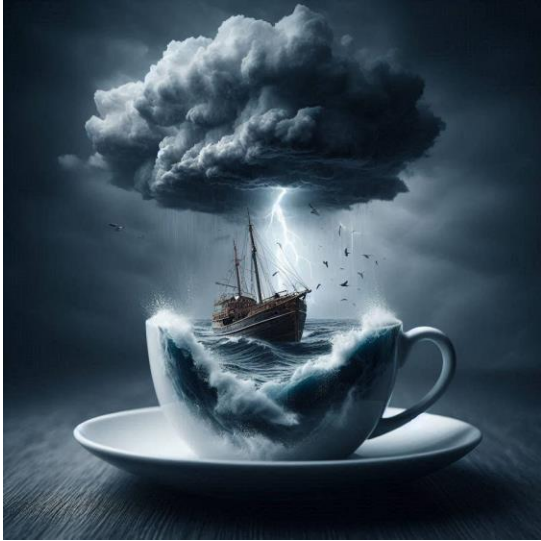
A Tempest in a Teapot 3 by Dervish551 (Antarctica)