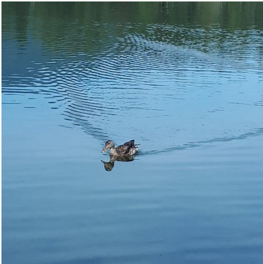
Killer duck satisfied by driving those two kayak wussies off Gardom Lake