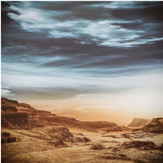
Dustywind Fini by Perilzof (USA)