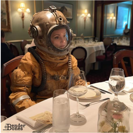
©Bender Bones Safe Dating by Benderbones (Benjamin Jones), USA