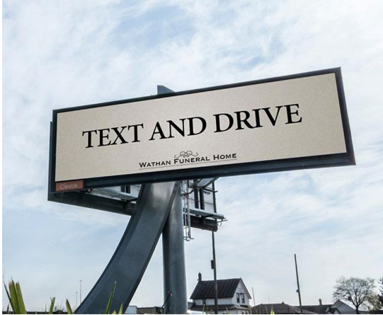
Sign sponsored by Wathan Funeral Homes