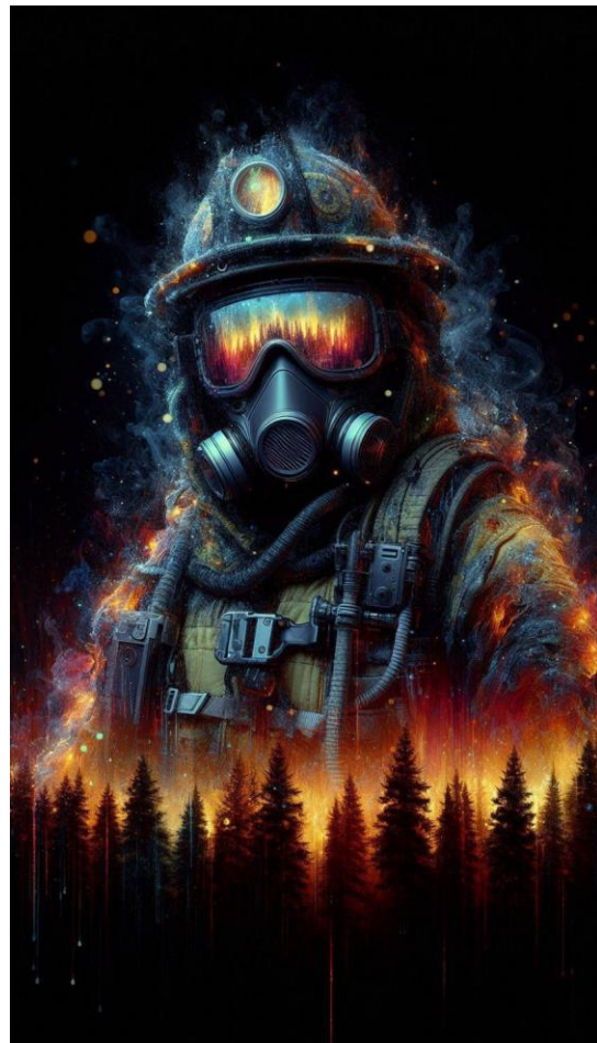
AI Art (untitled) by Nicolas Rain (Ukraine)