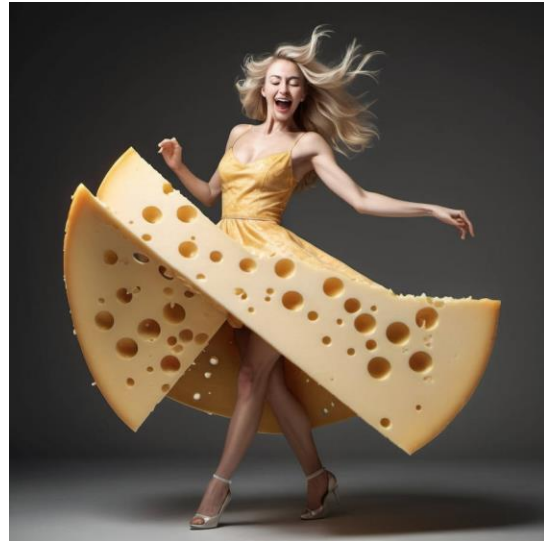
The latest in cheesy dresses