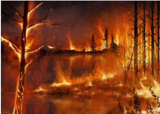
Lighting the Night by Stehanie Shimeredla (USA)

I chose not to get into burnt houses as it brings up too many painful memories.