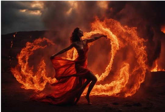
Daily Dreamup – Pyromancy by Jjabbic (UK)