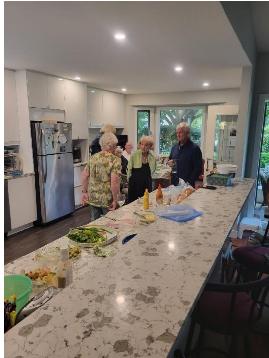
Dinner is served